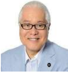
Keizou Takemi PhD

Minister of Health, Labour and Welfare of Japan. Former WHO Universal Health Coverage Goodwill Ambassador. Vist. Prof. Keio University, School of Medicine, Tokyo