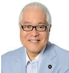
Keizou Takemi PhD

Minister of Health, Labour and Welfare of Japan. Former WHO Universal Health Coverage Goodwill Ambassador. Vist. Prof. Keio University, School of Medicine, Tokyo