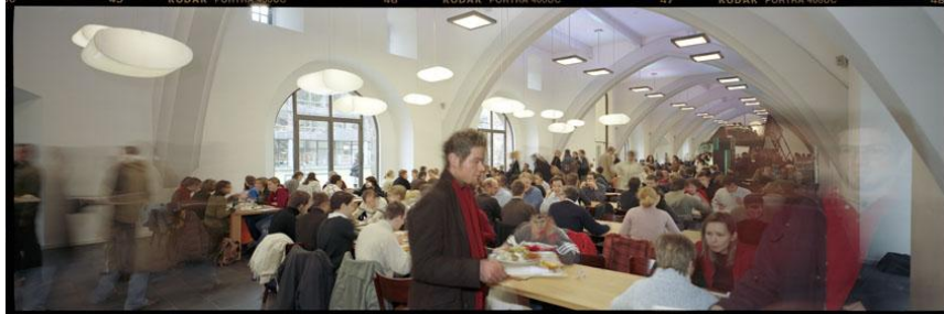
Mensa in the "Marstallhof" located at Mastallhof 1, Heidelberg

You can get your lunch ticket at our onsite registration desk. Please come by our desk. The restaurant locates in front of the conference building. It takes a couple of minutes on foot. There are several different menus so that you can choose your food.